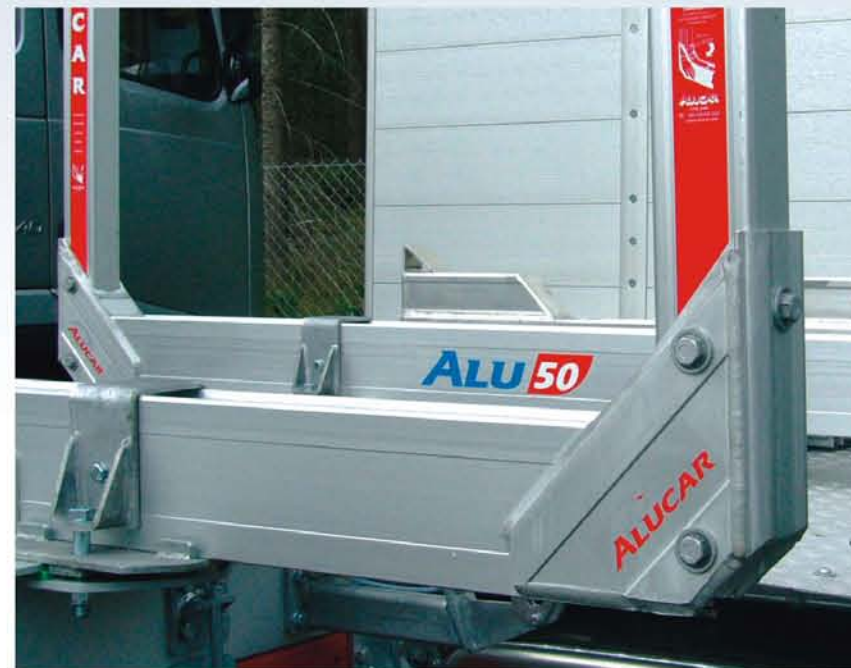
Secure bolted fitting of stakes on bunkframe